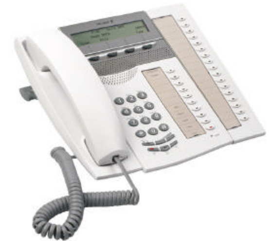
MD Evolution System telephone